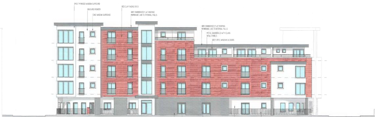
FRONT ELEVATION (ONTO DONEGALL ROAD)

NOTE: HEIGHT OF ADJACENT APARTMENT BUILDING